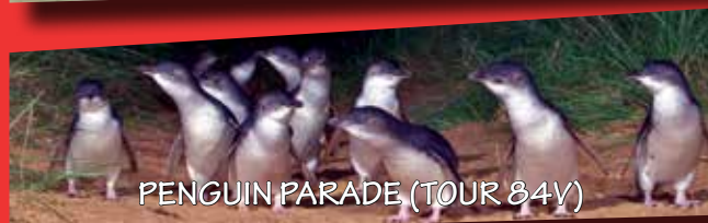
PENGUIN PARADE (TOUR 84V)