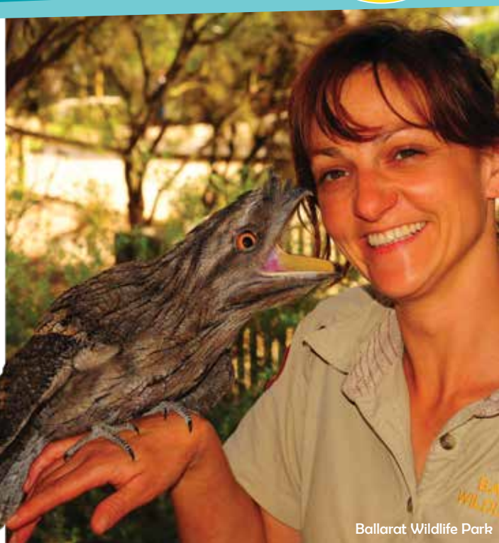
Ballarat Wildlife Park