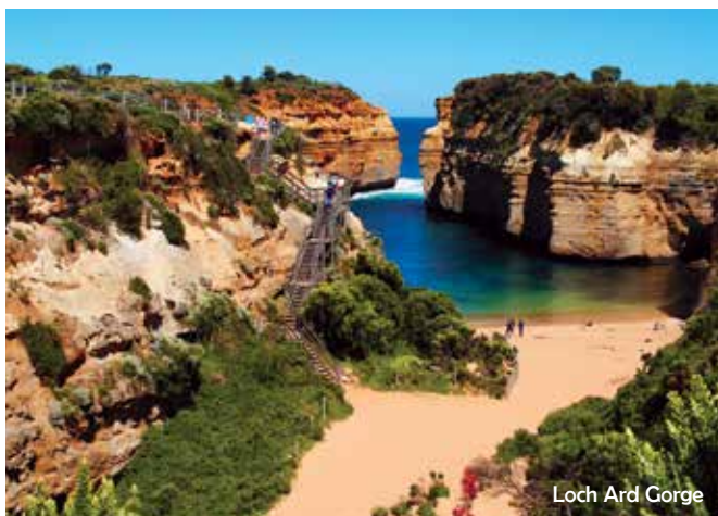
Loch Ard Gorge