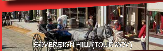
SOVEREIGN HILL (TOUR 80V)