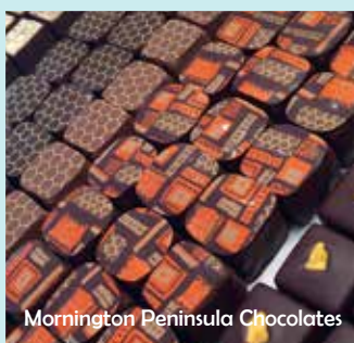
Mornington Peninsula Chocolates