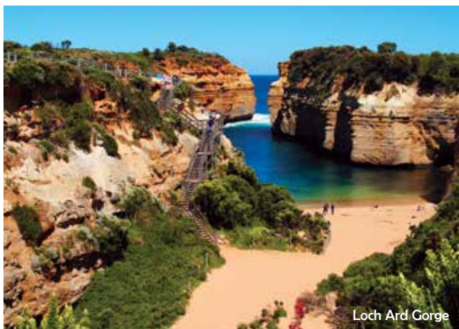
Loch Ard Gorge