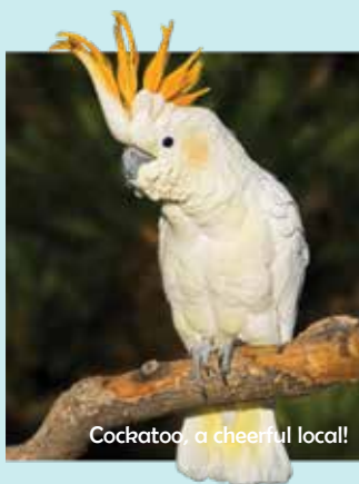
Cockatoo, a cheerful local!