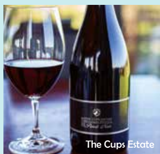
The Cups Estate