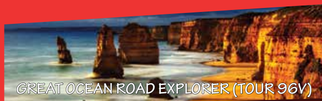
GREAT OCEAN ROAD EXPLORER (TOUR 96V)