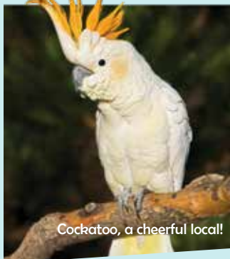
Cockatoo, a cheerful local!