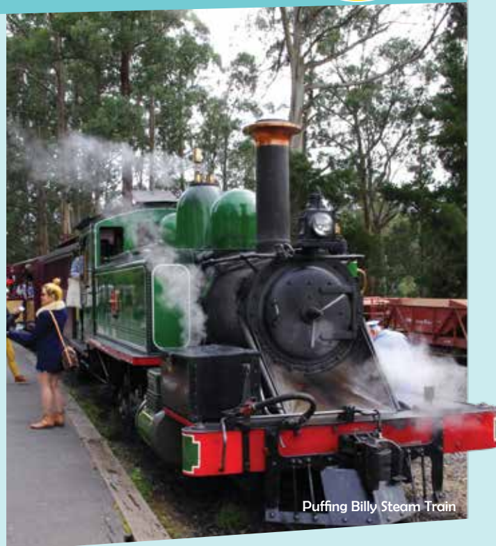
Puffing Billy Steam Train