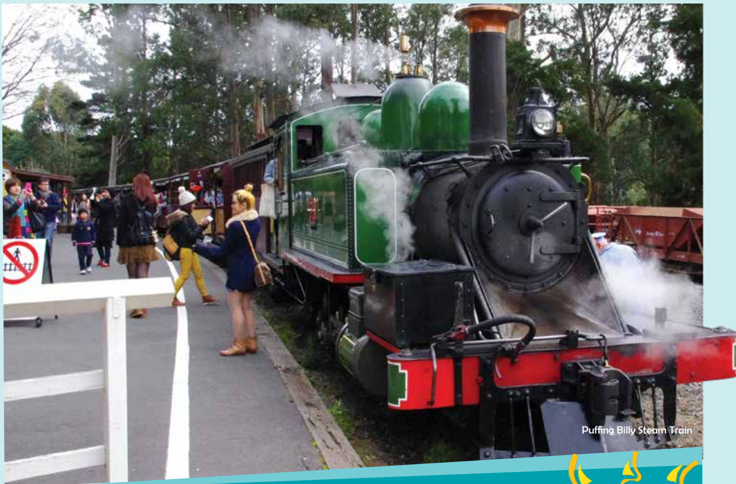
Puffing Billy Steam Train