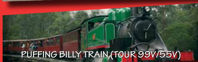
PUFFING BILLY TRAIN (TOUR 99V/55V)