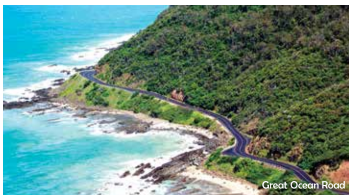
Great Ocean Road