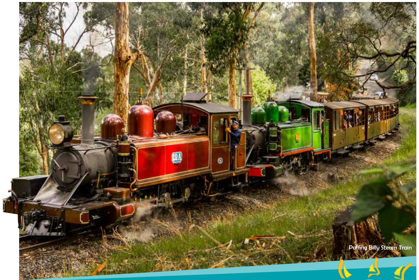
Puffing Billy Steam Train