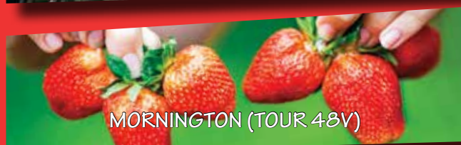
MORNINGTON (TOUR 48V)